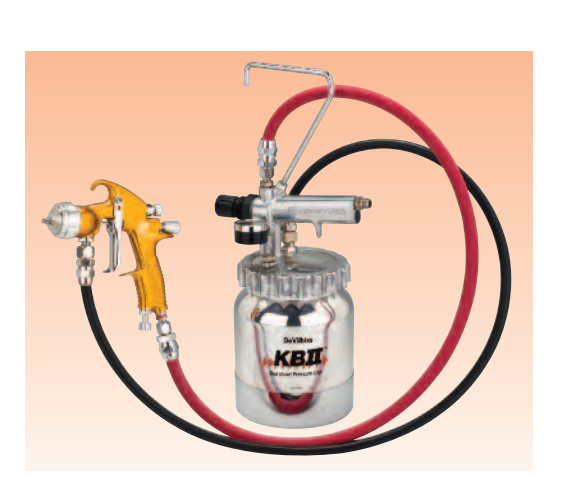
Pro LITE gun with DeVilbiss KBII 2 litre pressure cup system.

PRO Lite GUN PART NUMBER FORMAT Check option table for availability of Cap and Tip size combination.