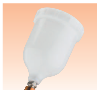
GFC-501 600ml Acetyl Cup included in all Gravity gun Kits