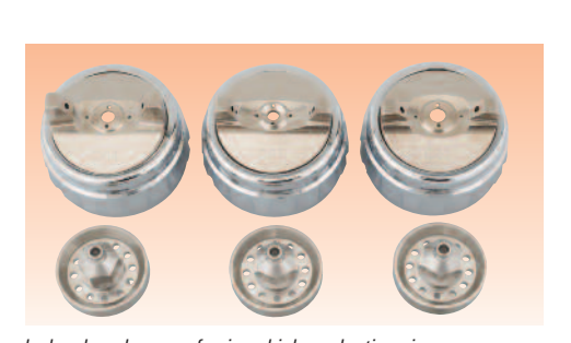
Newly developed range of unique high production air caps specifically for the ceramics market with wide spray fan and high fluid flow characteristics.

Check option table for availability of Cap and Tip size combination.